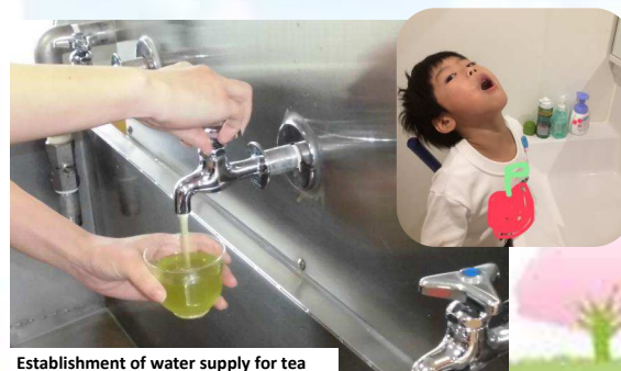
Establishment of water supply for tea

Habitual gargling to prevent colds and influenza